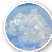
FM-12oKE-HCN Ice: Nugget