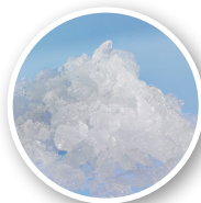
FM-12oKE-HC Ice: Flake